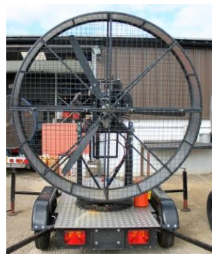
Fig 1. Exterior 68" Wind Machine on its trailer