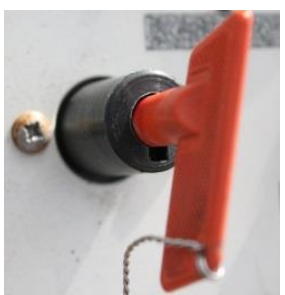
Fig 3. Ignition & Key