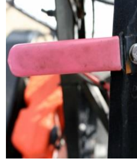
Fig 5. Choke